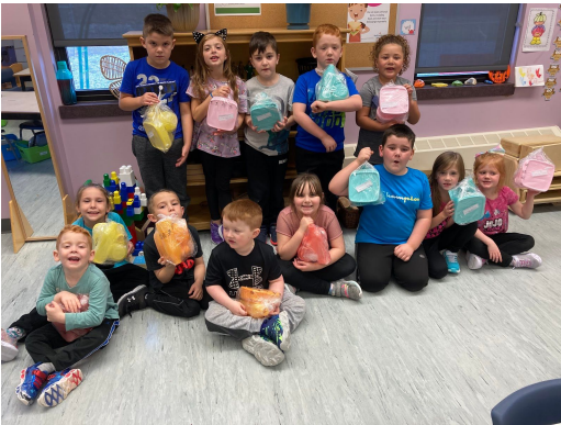
Grade K-1 proudly displaying their donated containers.