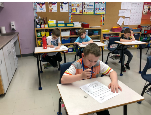
Grade 2 students busy as bees!